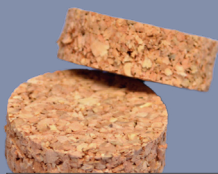
32GA 1/4" CORK WADS 14CW32 | #14CW32