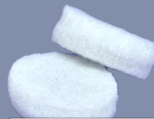
20GA 1/4" FELT WADS 14FW20 | #1221420

Filler & cushion wads occupy space below the pellets so that the load can be crimped properly. Remember, different payloads and different pellet sizes occupy different volumes, so you will want an assortment of sizes on hand. Overshot cards improve overall crimp quality and seal in small shot and/or buffer. We recommend 32ga cork or 20ga felt fillers for inside the 20 gauge wads (felt is soft and can be forced into the base of the wad).