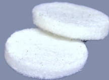
20GA 1/8" FELT WADS 18FW20 | #1221820