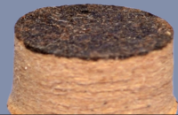
.410 1/2" FIBER WAD FC410 | #FC 410 .430 1/2" FIBER WAD FC430 | #FC 430