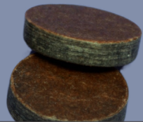
28GA 1/8" MAXI-NITRO CARD NC28 | #NC 28

Filler & cushion wads occupy space below the pellets so that the load can be crimped properly. Remember, different payloads and different pellet sizes occupy different volumes, so you will want an assortment of sizes on hand. Overshot cards improve overall crimp quality and seal in small shot and/or buffer. We recommend .410 & .430 Bore fillers for inside the 28 gauge wads.